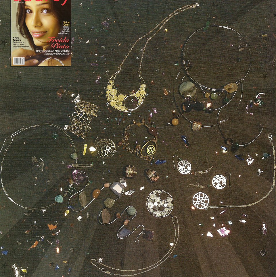
Clockwise from top right: Space Mermaid "Dream" necklace in snow, Kayo.nyc "Petri" earring with coral and with chrysoprase, Jessica Hicks round "Kaleidoscope" necklace, Buji Bijoux "Jupiter" silver necklace, Wahine Jewelry "Honi" ring and pearl thick ring, Space Mermaid "Dream" necklace in mermaid tail, Jessica Hicks round "Giraffe" earrings, Marcia Moran gold ovals cuff, and Buji Bijoux "Eclipse III" crescent necklace. Center: Zhen-U.N. "Lakshmi" bracelet.